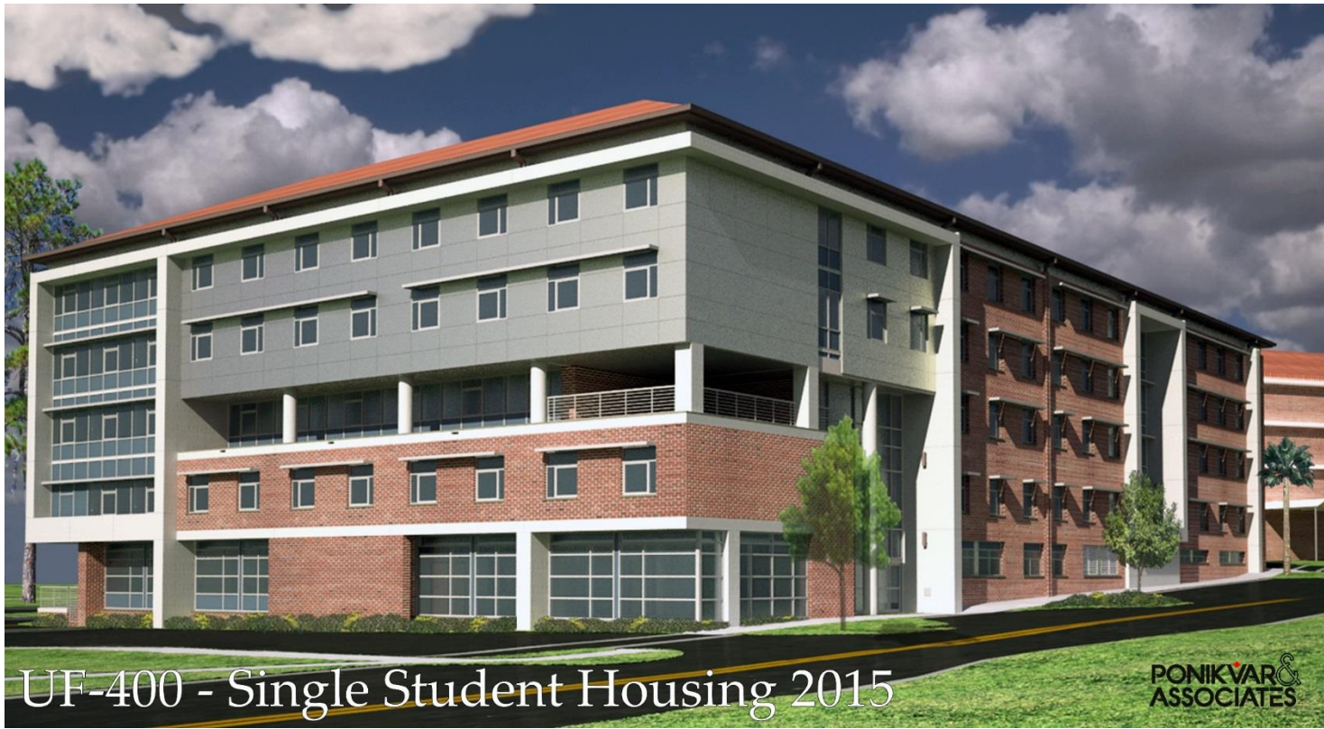
UF-400 - Single Student Housing 2015